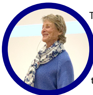
Mary King - 6 times Olympian

The cost is just £2 per person with free refreshments and a chance to speak to the speaker after the talk.